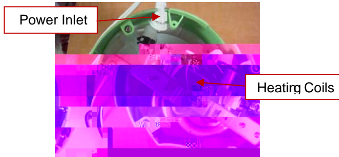
Figure 3: Heating coils of Iced Tea Maker

Three heat transfer processes are identified in this system as shown in Figure 4: (1) tap water flows through a tube heated by coil; (2) hot water passes through a transition tube that is surrounded by tap water; and (3) the tea is mixed with ice cubes in a decanter to reach a thermal equilibrium.