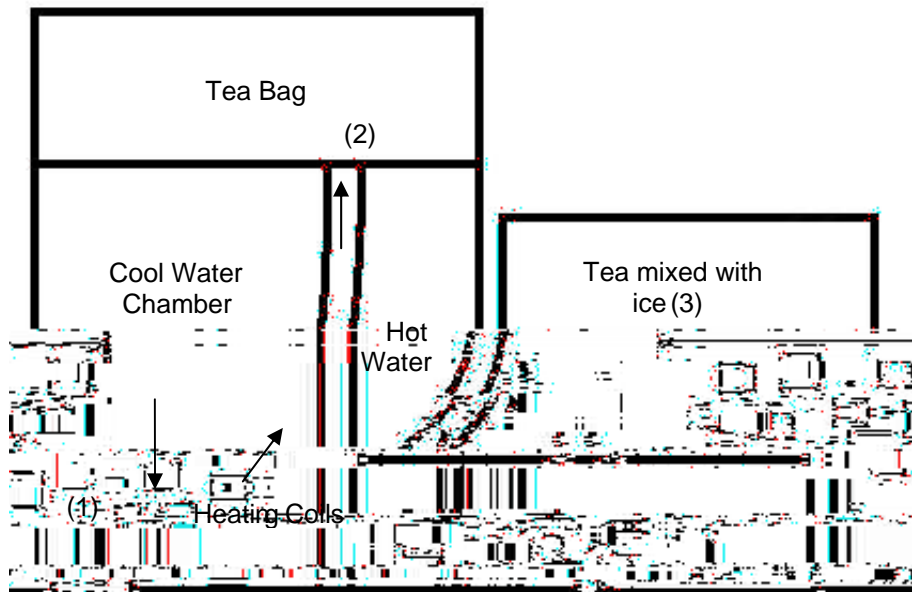
Figure 4: Schematic of Heating and Cooling Processes

Three heat transfer processes are identified in this system as shown in Figure 4: (1) tap water flows through a tube heated by coil; (2) hot water passes through a transition tube that is surrounded by tap water; and (3) the tea is mixed with ice cubes in a decanter to reach a thermal equilibrium.